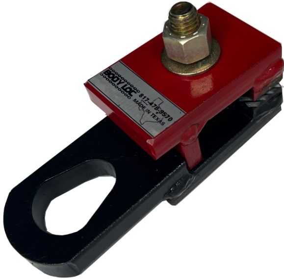
BL-31-2 2" CLAMP