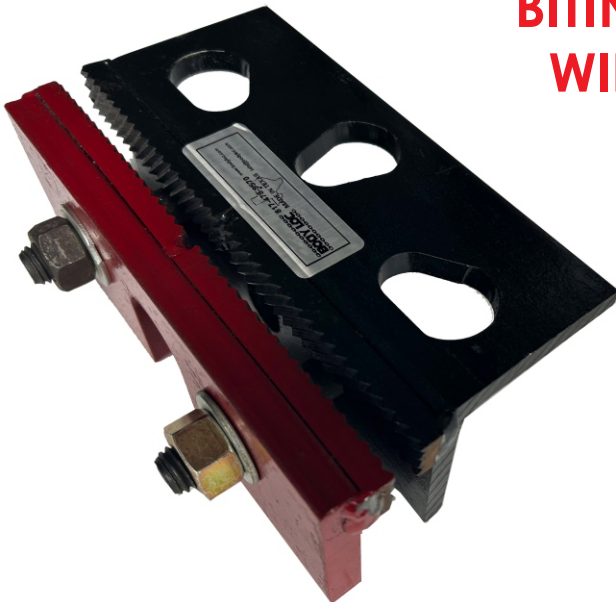
BL-31-8 8" CLAMP